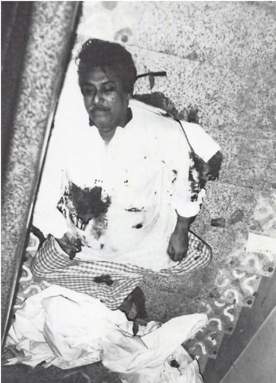
Sheikh Mujibur Rahman after he had been killed by the majors. His body lies sprawled on the staircase of his home in Dhaka with the right hand still clutching his favorite pipe.