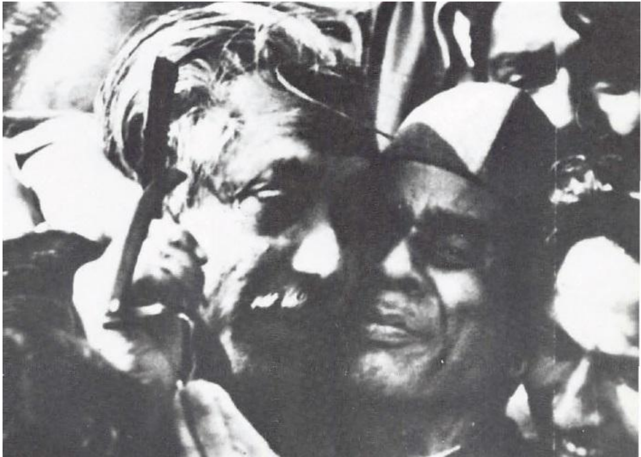
On returning triumphantly to Dhaka after the liberation war, Sheikh Mujibur Rahman receiving a Judas kiss from Khandaker Moshtaque Ahmed who connived at his assassination and succeeded him as President for 83 days in 1975.