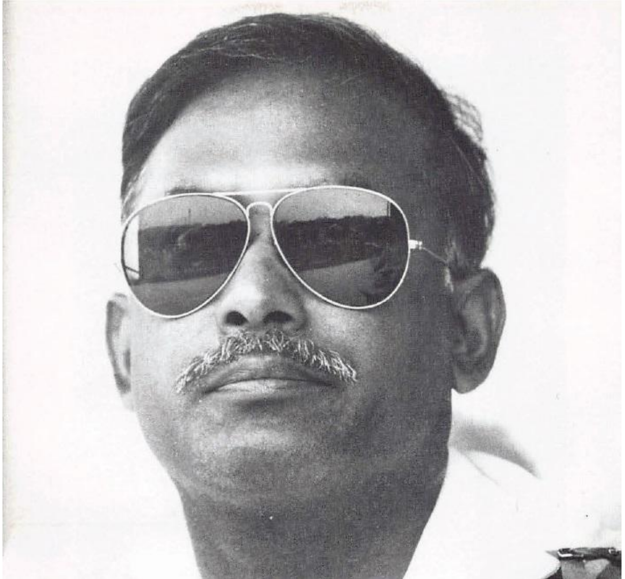
General Zia Rahman, assassinated President of Bangladesh