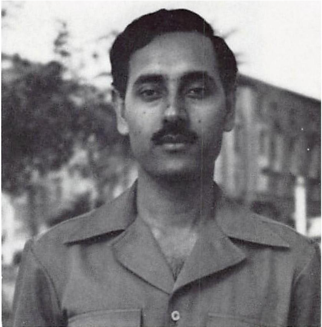
Major Khandaker Abdur Rashid, CO of 2nd Field Artillery. Farooq is brother-in-law and partner in Mujib's assassination