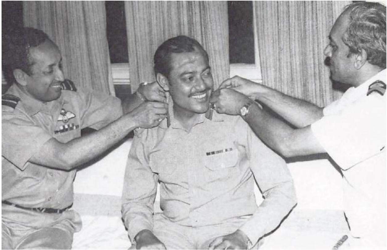
BATMEN EXTRAORDINARY: Air Vice Marshal Towab and Admiral M. H. Khan, the Air Force and Navy Chiefs, pinning new badges of rank on Khalid Musharraf, leader of the short-lived coup in November 1975, who promoted himself to Major General. A day later Khalid was killed during the Sepoy Mutiny and the Air Force and Navy Chiefs switched loyalty to the new Army strongman, Major General Ziaur Rahman.